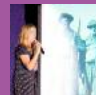
Plus a varied programme of Presentations...