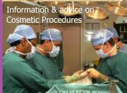
Information & advice on Cosmetic Procedures