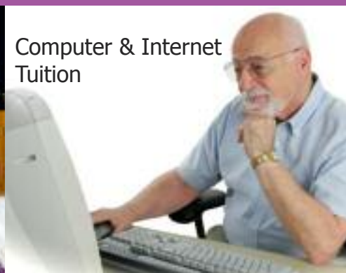
Computer & Internet Tuition