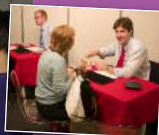
Visitors can sell their unwanted gold, silver and jewellery.